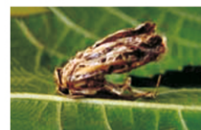
GROWTH AFFECTED MOTH