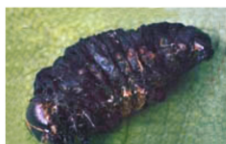
GROWTH AFFECTED LARVA