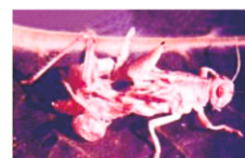
GROWTH AFFECTED GRASSHOPPER