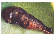
LARVAL PUPA INTERMEDIATE